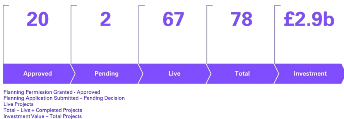
Figure 1 Performance Summary

4.3 Key project updates and risks escalated to the Regeneration Programme Board for action on the 26 October 2023 are captured in figure 2. Of note, since the last performance update to Cabinet in July 2023, 5 more projects have completed, and planning permission has been secured on several key sites: